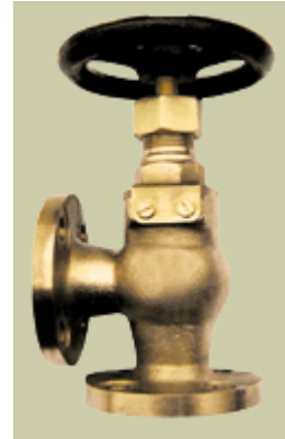
JISF7304/7410 Cast Bronze Angle,SDNR Valve 16K Detail