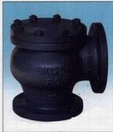
Marine Cast Iron Lift Check Globe Valves JIS F7358 5K