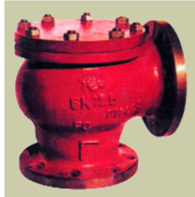
JISF7358/7359 Csat Iron Lift Check Globe & Angle Valve Detail