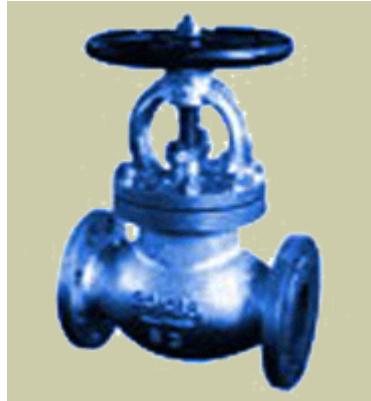
JISF7313/7473 Cast Steel Globe,SDNR Valve 20K Detail