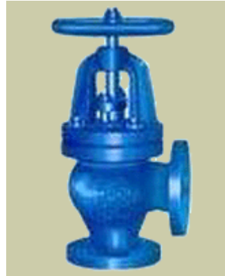
JISF7312/7312C Cast Steel Angle,SDNR Valve 5K Detail