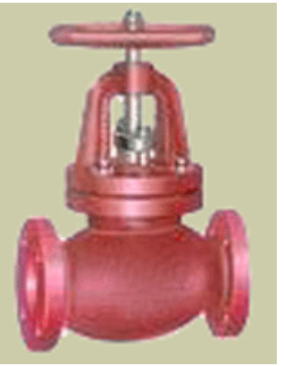
JISF7307/7375 Cast Iron Globe,SDNR Valve 10K Detail