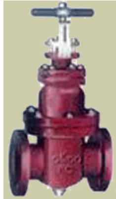
JISF7363 Cast Iron Gate Valve 5K Detail