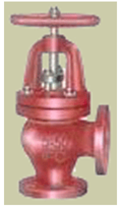
JISF7306/7354 Cast Iron Angle,SDNR Valve 5K Detail