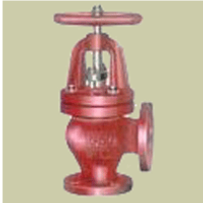
JISF7310/7378 Cast Iron Angle,SDNR Valve 16K Detail