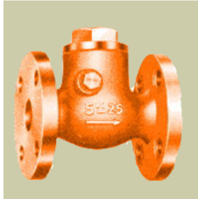
JISF7371 Cast Bronze Swing Check Valve 5K Detail