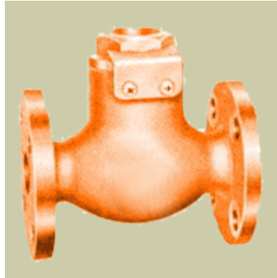
JISF7356 Cast Bronze Lift check Valve 5K Detail