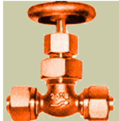
JISF7388 Cast Bronze Globe Valve 20K Detail